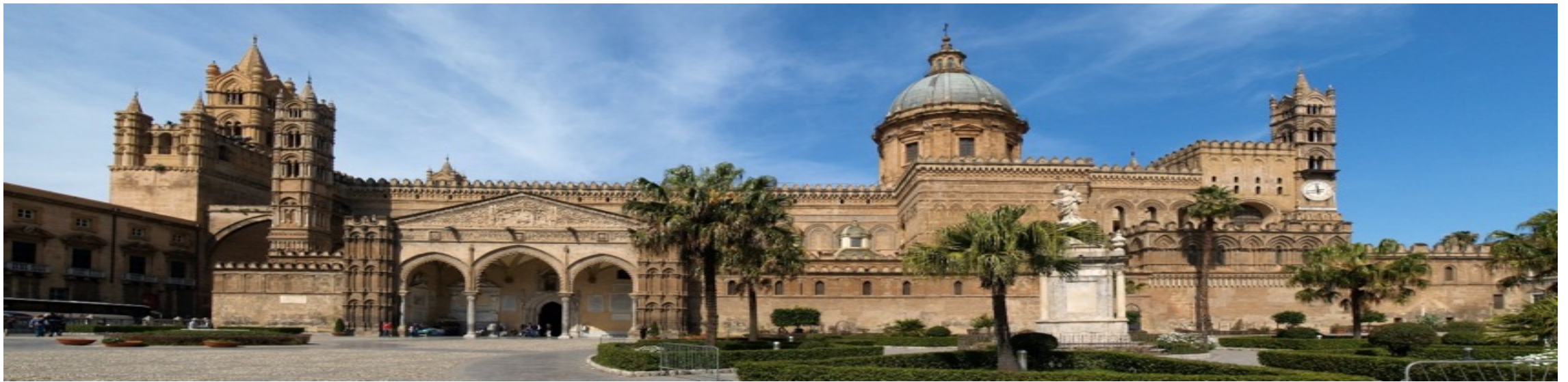
↑ Cathedral of Palermo